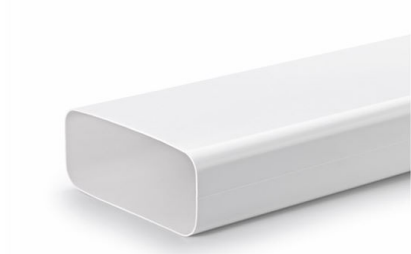
White tube - rectangular section 9700 532