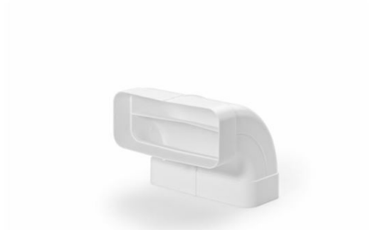
White Vertical 90° Corner connector - rectangular section 9700 535