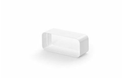
White connector - rectangular section 9700 533