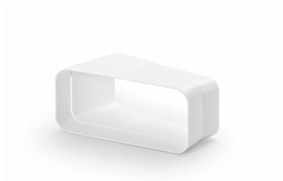
Horizontal 15° Corner connector - rectangular section 9700 536