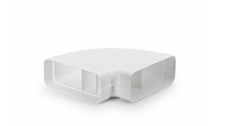
White Horizontal 90° Corner connector - rectangular section 9700 534